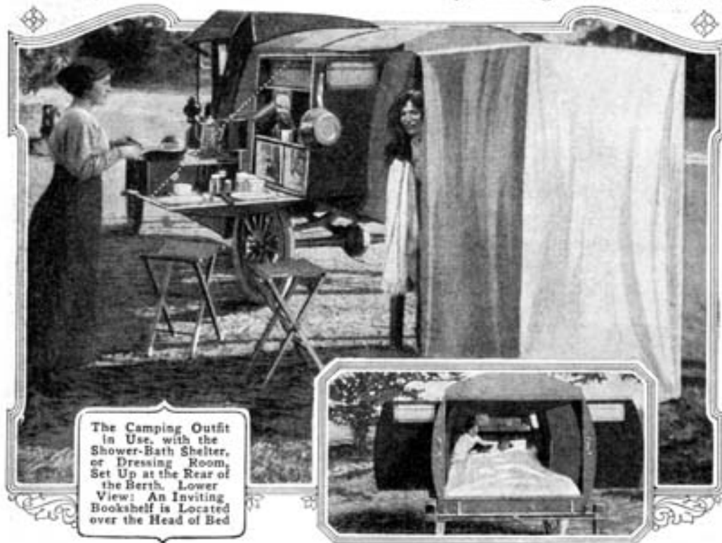
The Camping Outfit in Use, with the Shower-Bath Shelter, or Dressing Room, Set Up at the Rear of the Berth. Lower View: An Inviting Bookshelf is Located over the Head of Bed

The entire outfit is inclosed in a steel cylindrical case, and when closed measures 3 ft. 4 in. long, 4 ft. 4 in. wide, and 3 ft. 8 in. high. At the rear is a door hinged at its lower edge. By letting this door down and resting its outward end on two adjustable legs, the bed, a portion of which folds up against the door when the latter is closed, is laid out flat. When the compartment has been opened in this manner, two chests or cases are revealed occupying part of the space above the bed. By drawing these toward the