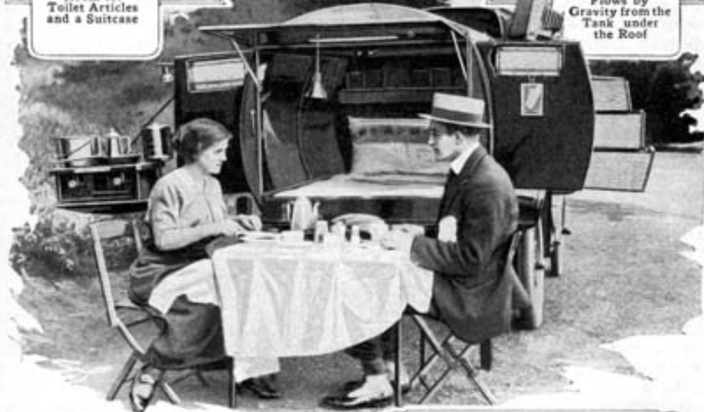
"All the Conveniences of Home": The Collapsible Automobile Camping Outfit Showing the Berth Made Up, the Chest of Drawers, the Kitchen Equip- ment, and the Dining Arrangement. Below: The Camping Outfit Closed