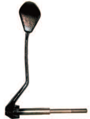
1925 Brake Pedal