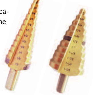
Examples of 7/8" Step Drills available from Harbor Freight. I mark the diameter that I want to drill to make it easy to see while drilling.